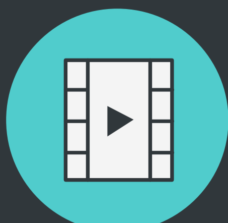
Diamonds are Forever 1971 Guy Hamilton