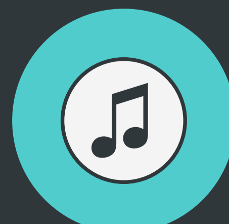
Amsterdam 1972 John Cale