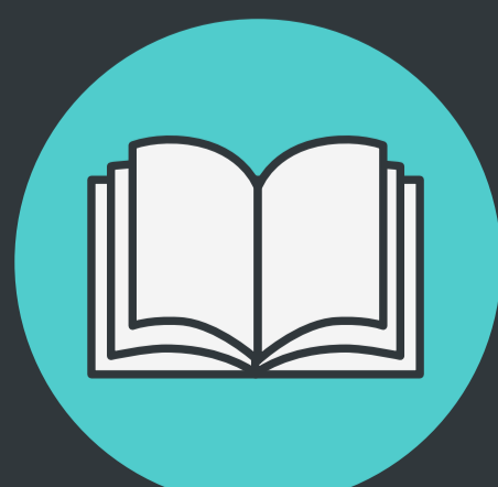
The Dinner 2009 Herman Koch